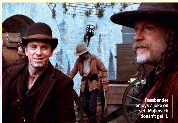
Fassbender enjoys a joke on set. Malkovich doesn’t get it.

Jonah Hex is out on September 3 and will be reviewed in the next issue.