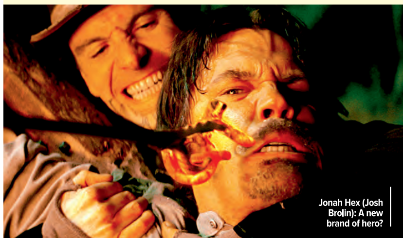
Jonah Hex (Josh Brolin): A new brand of hero?

A HERO WITH HALF A FACE. A VILLAIN WITH MAGIC CANNONBALLS. THE DIRECTOR OF HORTON HEARS A WHO!. EMPIRE REVEALS THE WEIRD, WILD STORY BEHIND JONAH HEX, THIS SUMMER'S MOST TROUBLED MOVIE